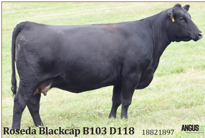
Roseda Blackcap B103 D118 18821897