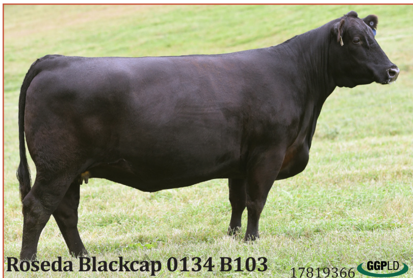
Roseda Blackcap 0134 B103 17819366

GAR Prophet Roseda Blackcap 0134 B103 Clifton Blackcap 6M62 0134